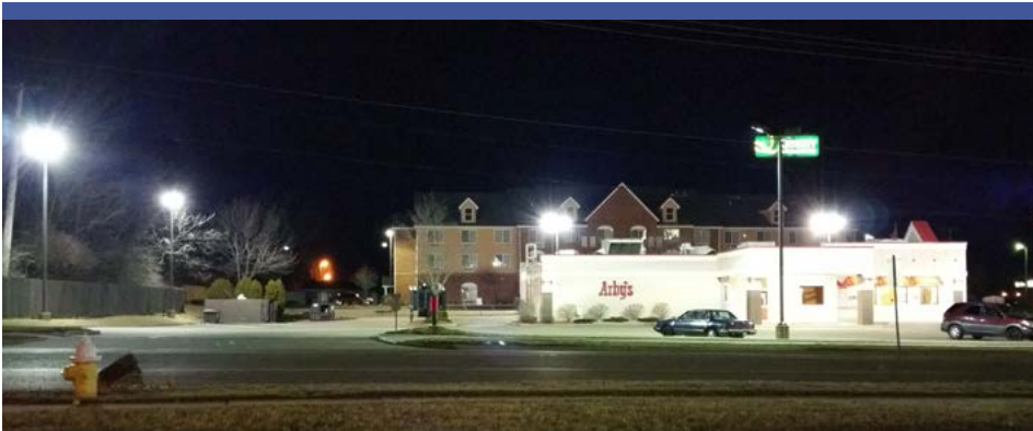
Arby's restaurant on Maxton Road: Lighting helps deter crime.